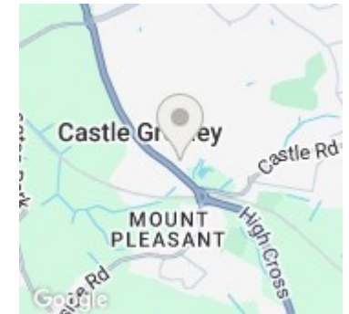
Illustration for identification purposes only, measurements are approximate and not to scale, unauthorised reproduction is prohibited.

Approx. Gross Internal Floor Area 1,476 sq. ft / 137.10 sq. m.